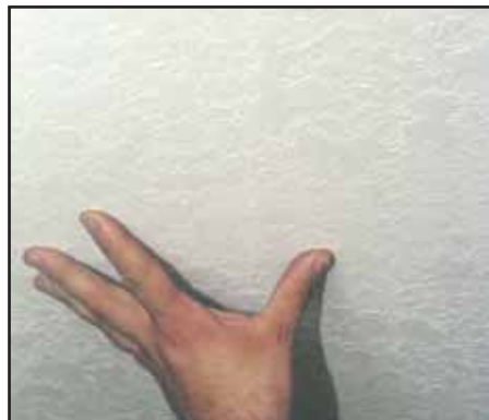
Step 5: Apply texture over entire ceiling.