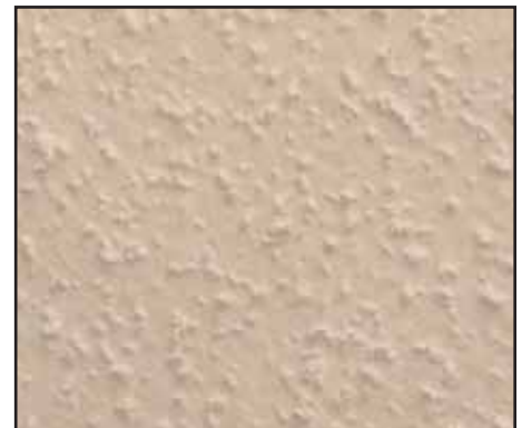
A variety of textures are available.