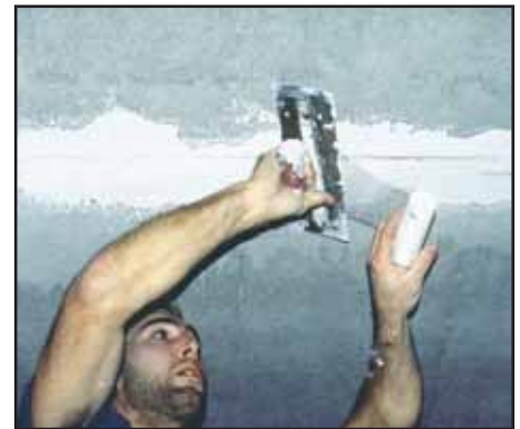
Step 3: Install fiberglass mesh over V-groove.