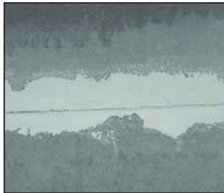
Step 2: Apply second coat over V-groove prior to fiberglass mesh installation.