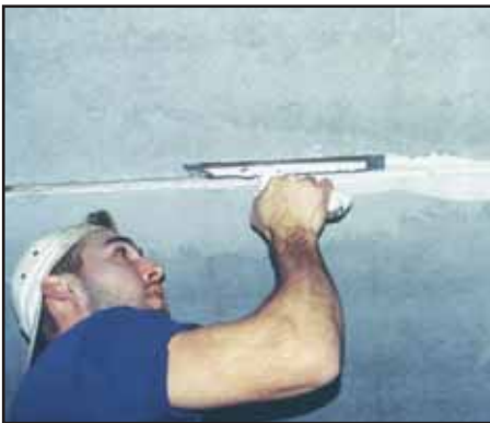
Step 1: Apply joint filler into the V-groove between the Spancrete plank.

The following are the steps being used in many regions to provide a jointless, textured ceiling. Contact your local texture applicator before starting your project.